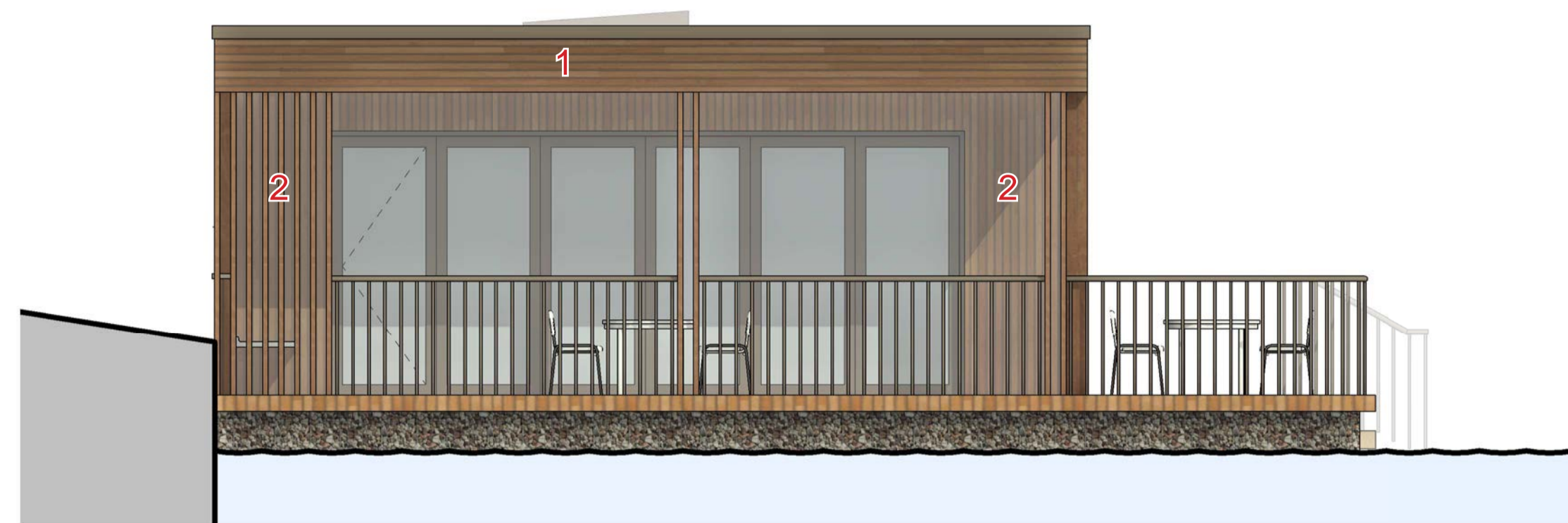
2 ELEVATION - EAST 1:50