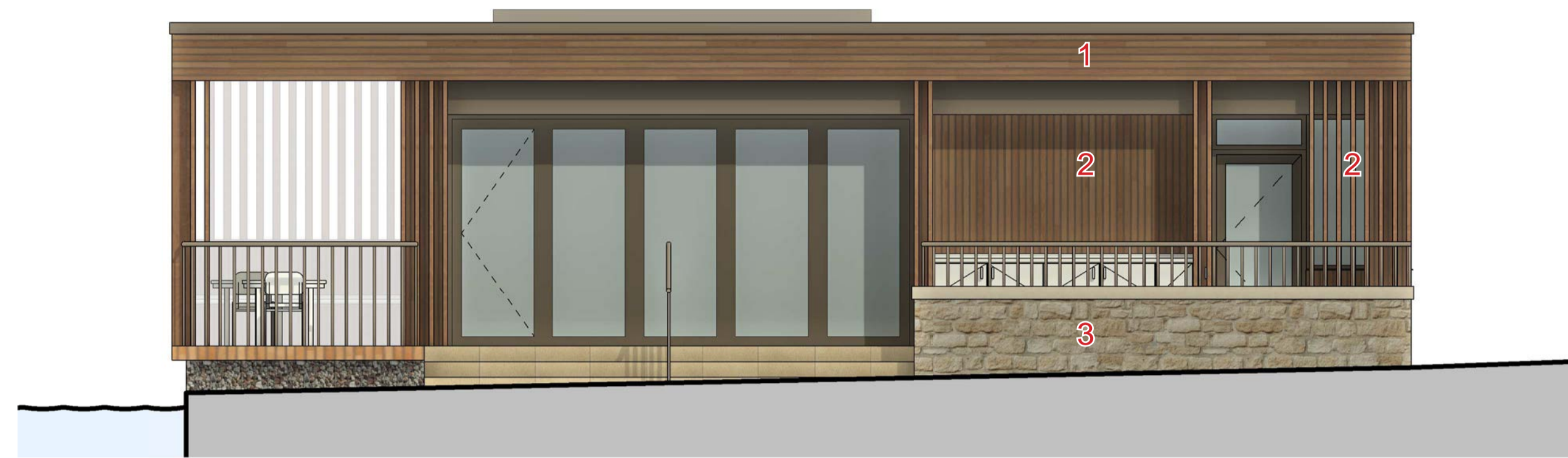
1 ELEVATION - NORTH 1:50