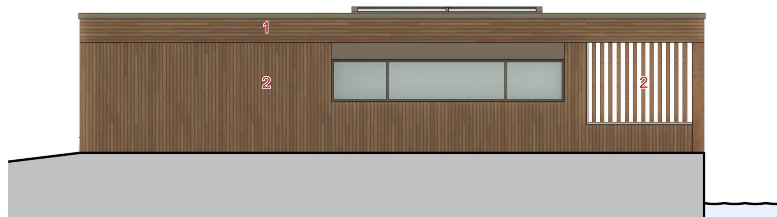
4 ELEVATION - SOUTH 1:50