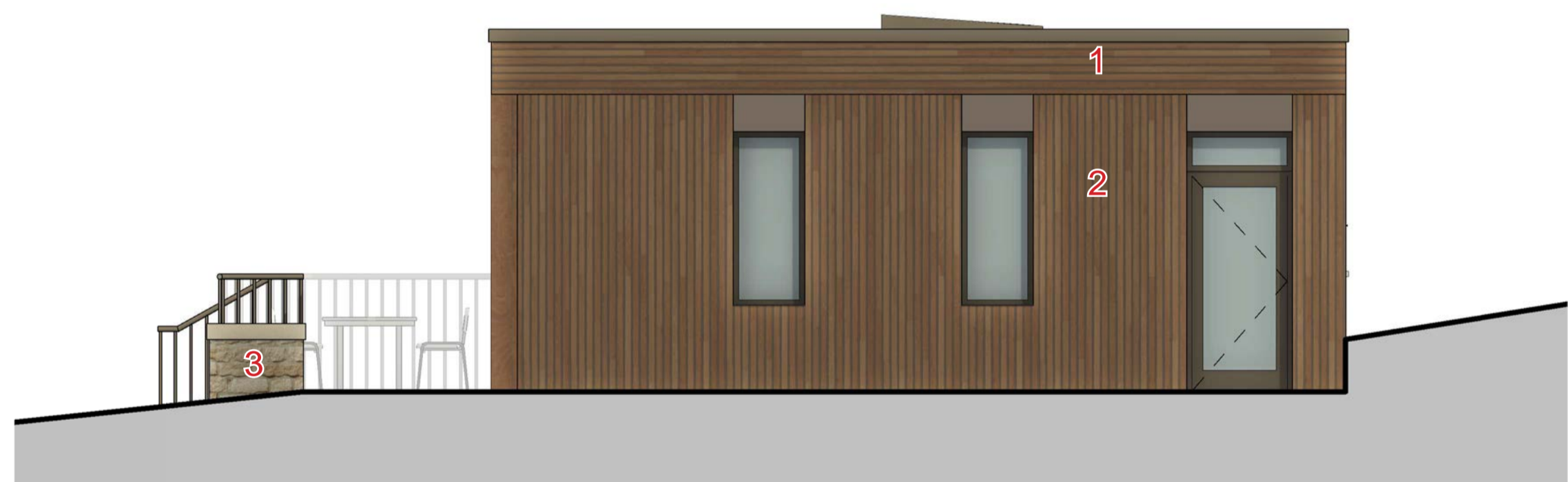
3 ELEVATION - WEST 1:50