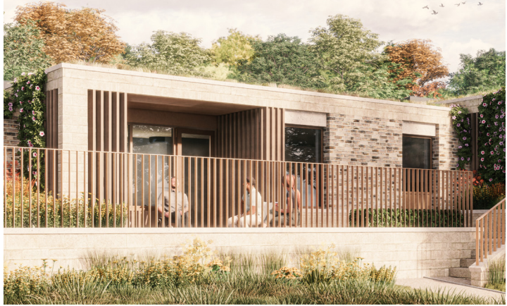
Original Facade Treatment - Stone & Brick (Now Superseded by facade treatments below)